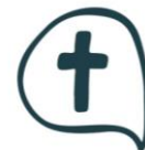
MAKE DISCIPLES 28:19